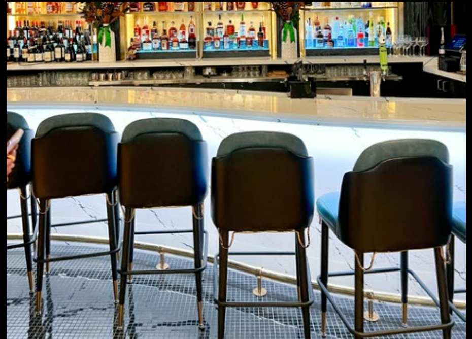
CORAL CHAIR & ESCAPE BAR STOOL