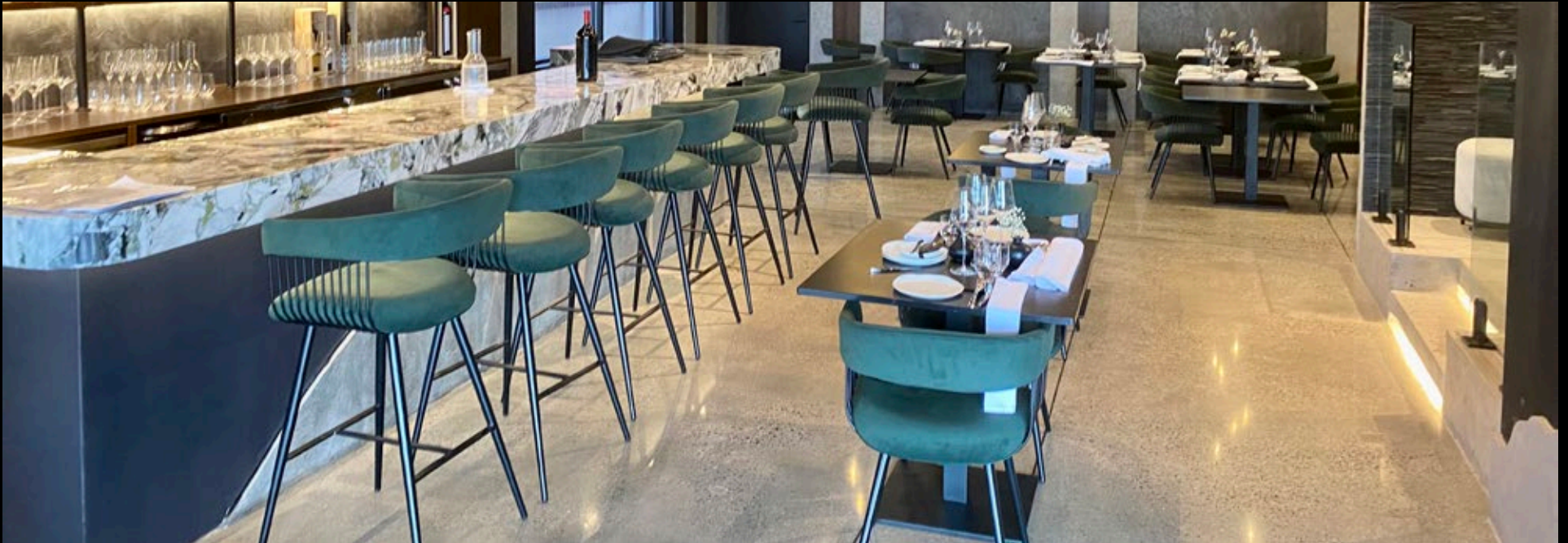
JADE CHAIR & BAR STOOL