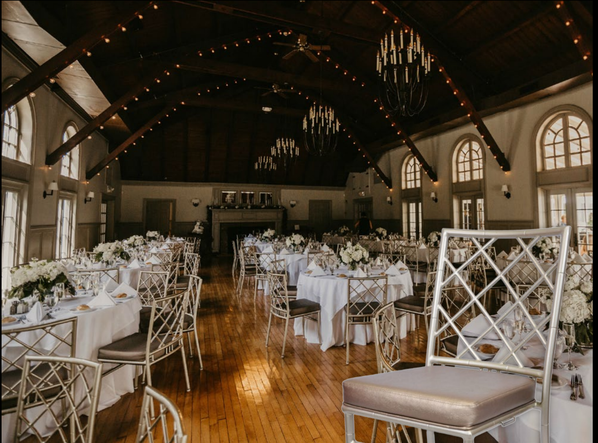
CHIAVARI DIAMOND CHAIR