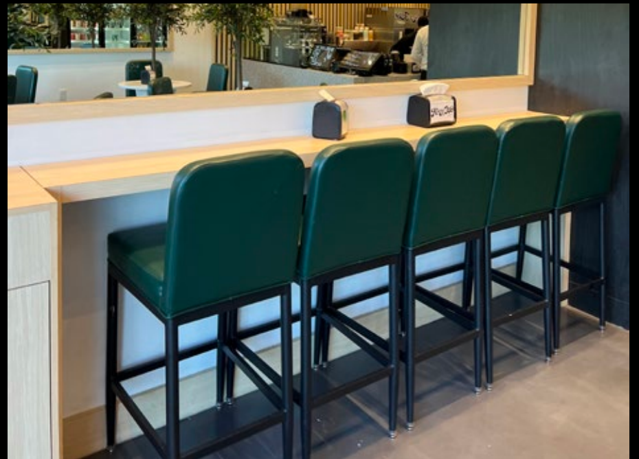
PARIGI CHAIR & BAR STOOL