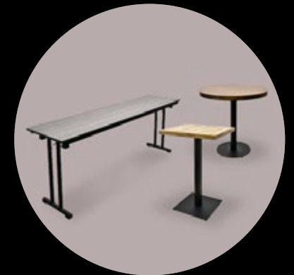
BANQUET & RESTAURANT TABLES