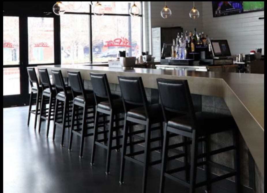
ALLAN II CHAIR & ALDO BAR STOOL