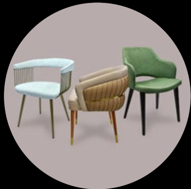
LOUNGE & LOBBY CHAIRS