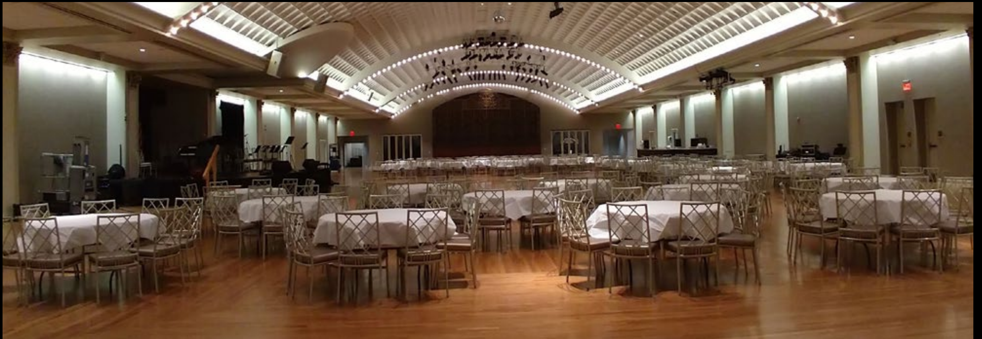
CHIAVARI DIAMOND CHAIR