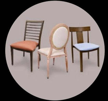
RESTAURANT & FINE DINING CHAIRS