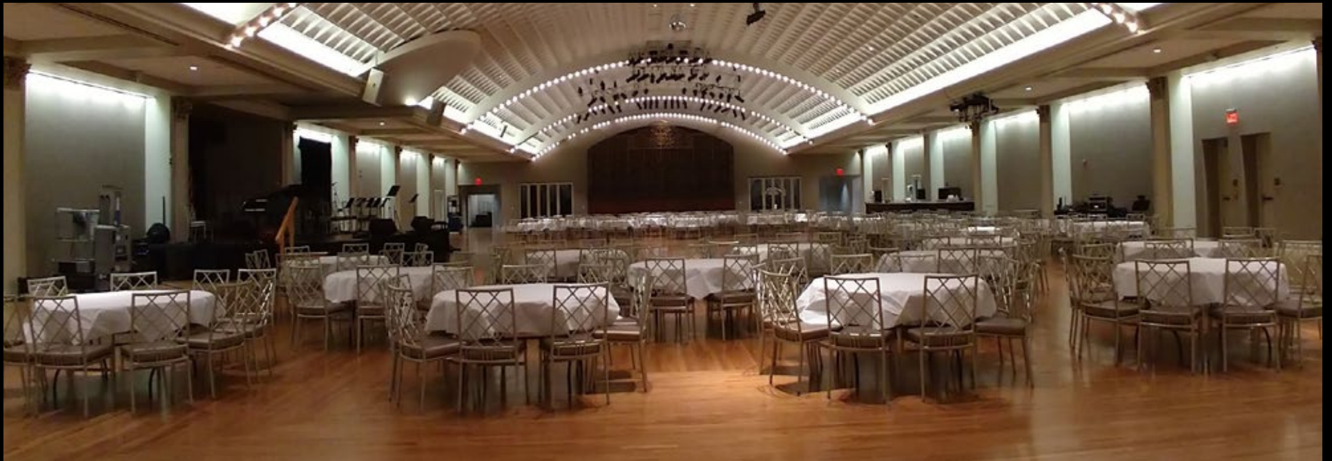
CHIAVARI DIAMOND CHAIR