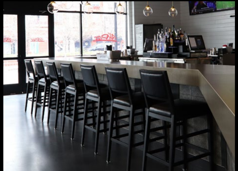
ALLAN II CHAIR & ALDO BAR STOOL