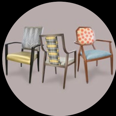
COUNTRY CLUB CHAIRS