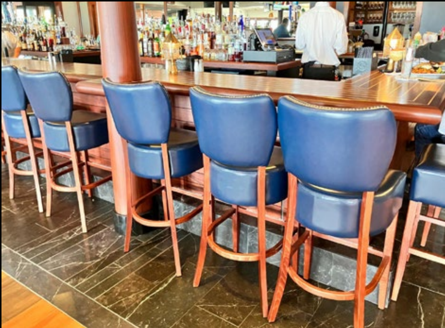
STOKE GRAND II CHAIR & BAR STOOL