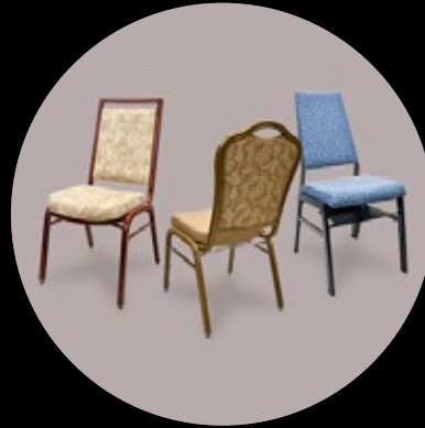
CONFERENCE & SANCTUARY CHAIRS